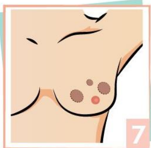
7 Look in the mirror for visual lumps