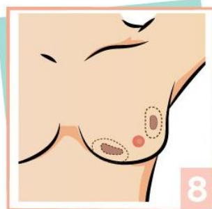
8 ...skin and texture changes...