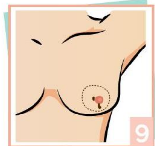
9 ...changes in nipple shape or abnormal discharge.