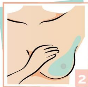
2 Examine entire breast and armpit area