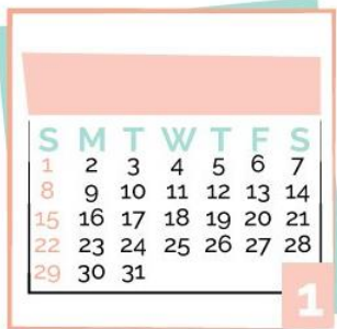
1 Self check once a month