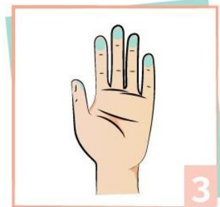
3 Gently use the pads of fingertips