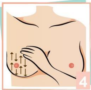
4 Top and Bottom